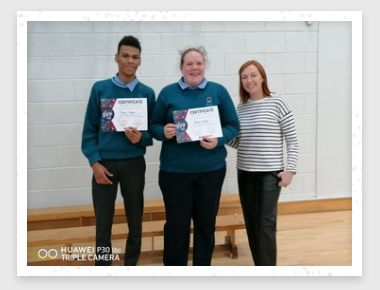
SENIOR SVP MEMBERS