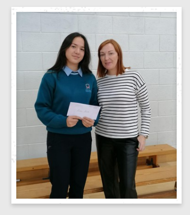
CIANA "EILEEN O DRISCOLL CREATIVE WRITING AWARD"