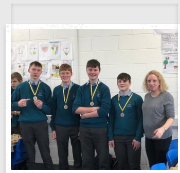
SENIOR CHESS TEAM- RUNNERS UP.