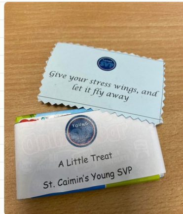
Busy at work