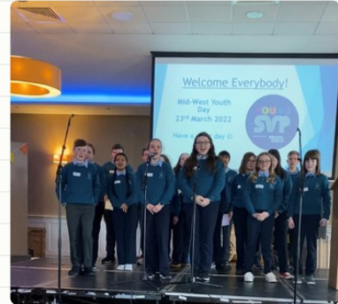
Mid West Youth Day