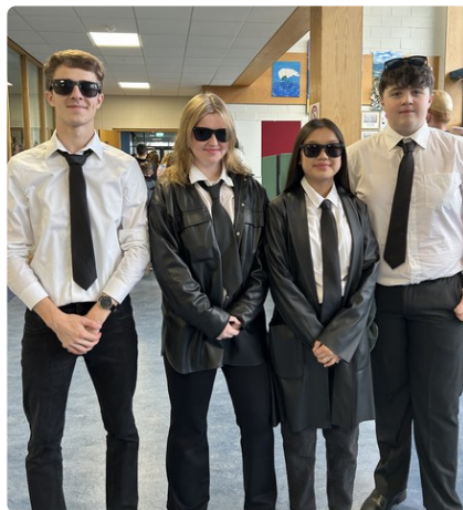
The Men and Women in Black!