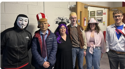
Spot the odd one out!

The entire school community pulled out all the stops on October 26th to raise money for Temple Street Children's Hospital in Dublin. Our Leaving Certs lead by example and looked fantastic