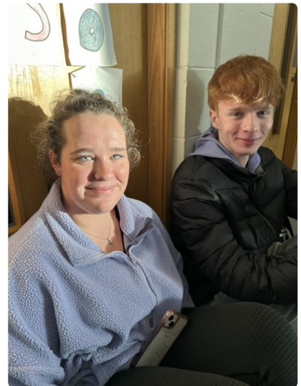
Looking great in purple.