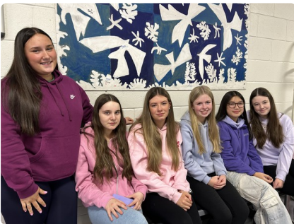
Ladies in Purple!

November 10th marked Colours Day in St. Caimin's where we celebrated inclusion and LGBTQ Awareness. The Leaving Certs were encouraged to wear purple and again they rose to the occasion. Congratulations to everybody who took part.