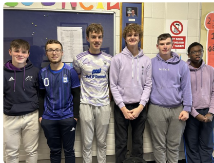
Lad in Purple!