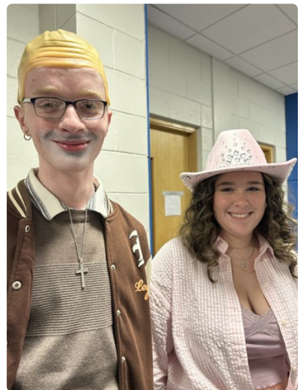
The Star Spangled Banner.