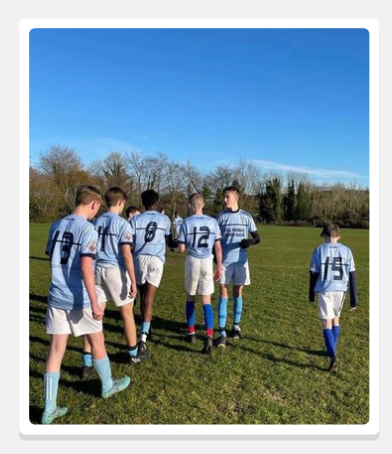
Victory for the Under 15 boys