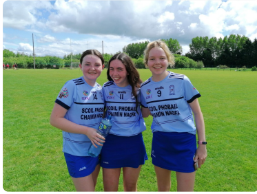
Bridge Camogie Gals