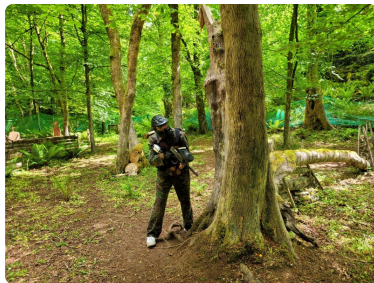
Action in the woods