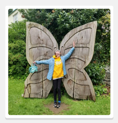
Spread your wings and fly!