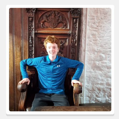
All Hail, King Bobby!