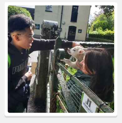
AJ had a little lamb...