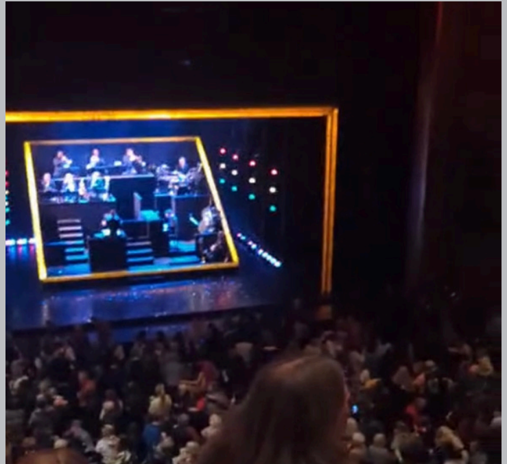
Photo of cast on stage